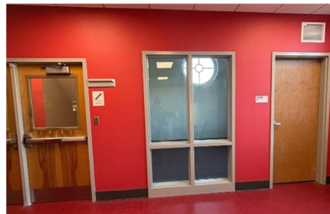
Before (left) and after (right) of a small group instruction space.