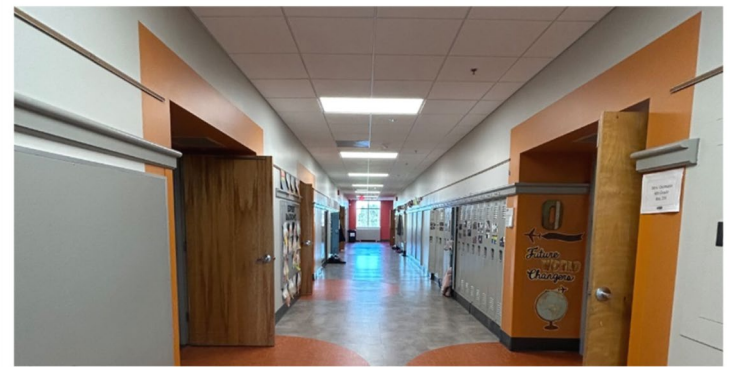
Before (left) and after (right) of the second-floor C corridor.